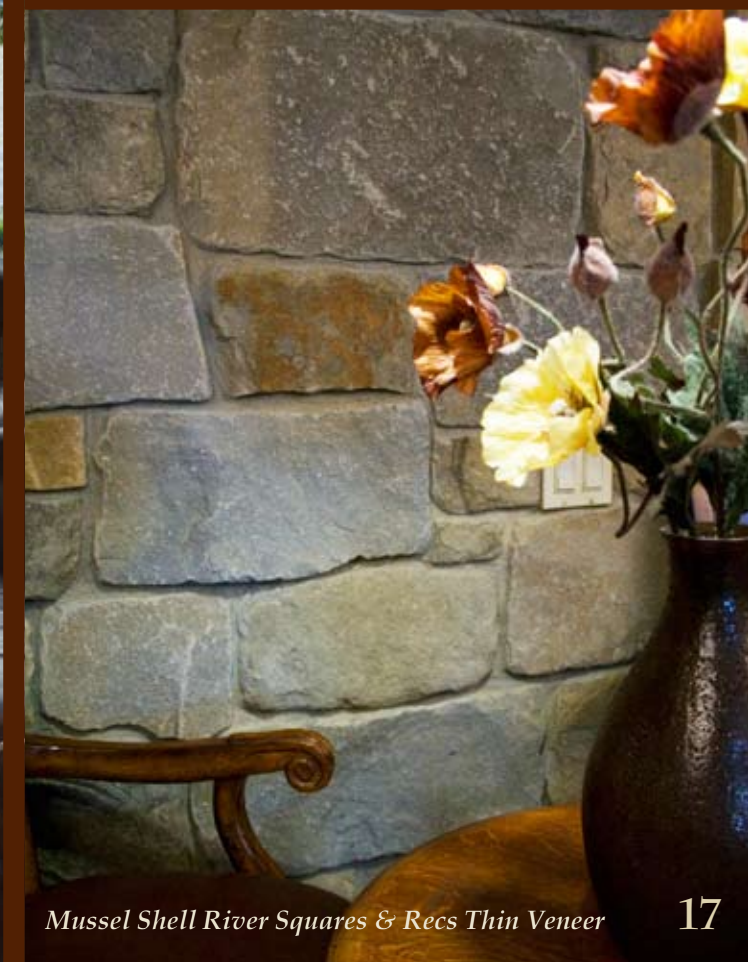
Mussel Shell River Squares & Recs Thin Veneer