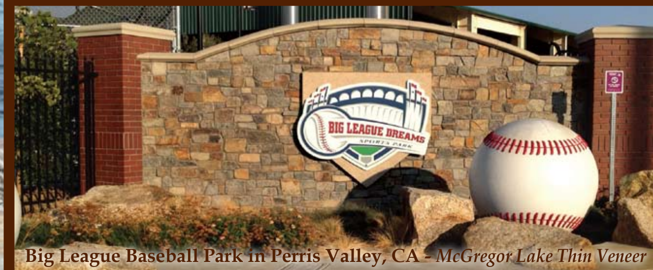
Big League Baseball Park in Perris Valley, CA - McGregor Lake Thin Veneer