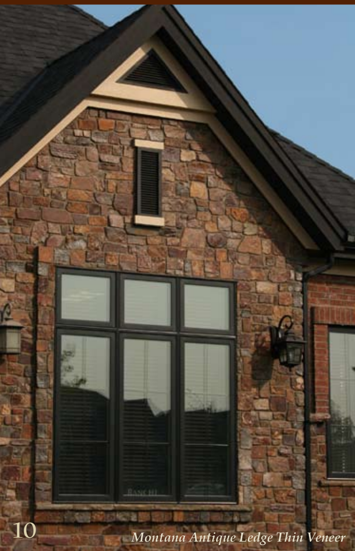
Montana Antique Ledge Thin Veneer