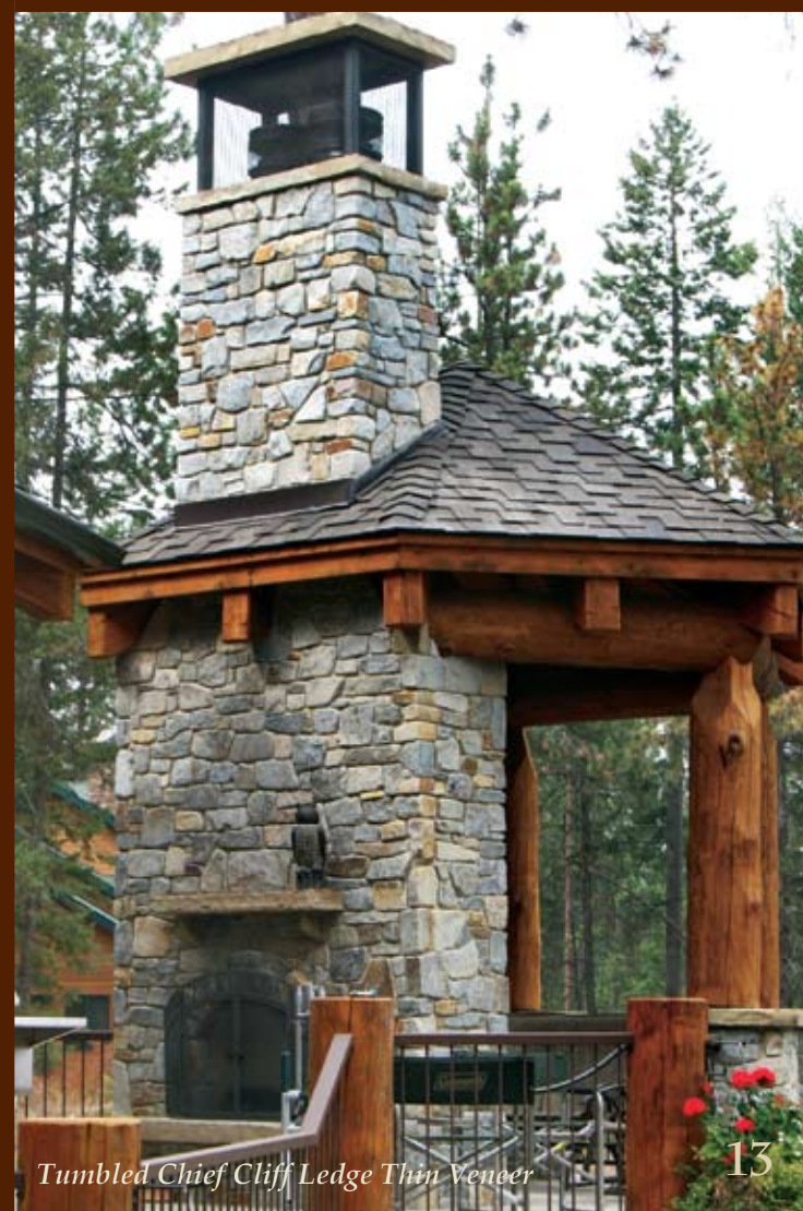
Tumbled Chief Cliff Ledge Thin Veneer