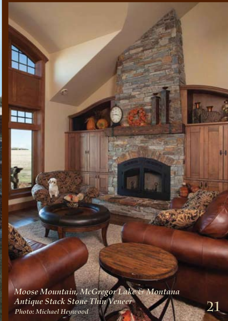
Moose Mountain, McGregor Lake & Montana Antique Stack Stone Thin Veneer