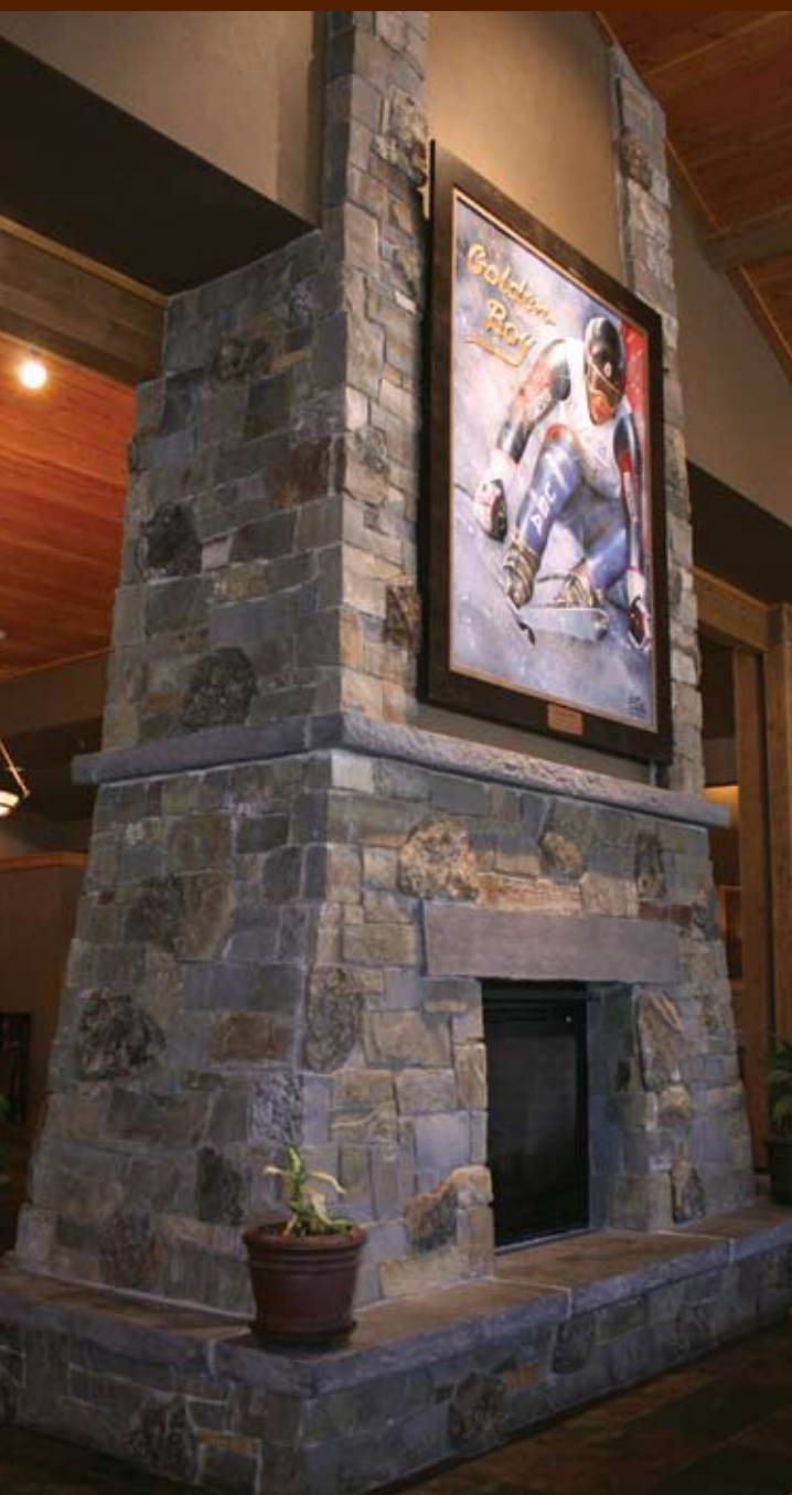
Highlands Ledge Thin Veneer with Montana Moss Rock Jumpers