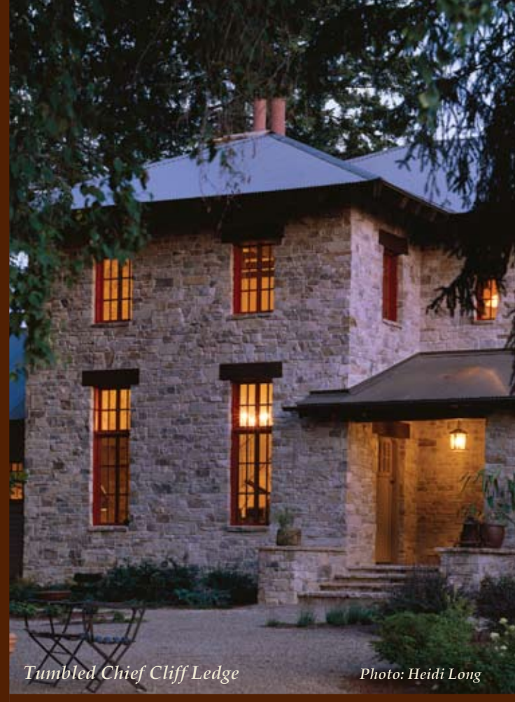
Tumbled Chief Cliff Ledge