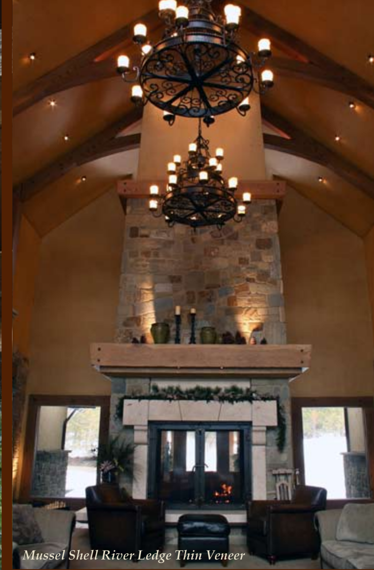
Mussel Shell River Ledge Thin Veneer

Mussel Shell River Ledge, Squares & Recs