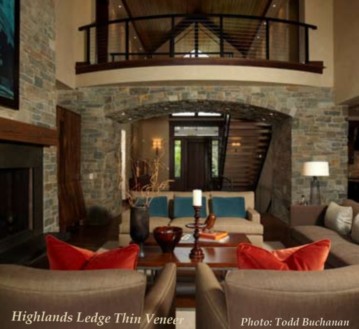
Highlands Ledge Thin Veneer