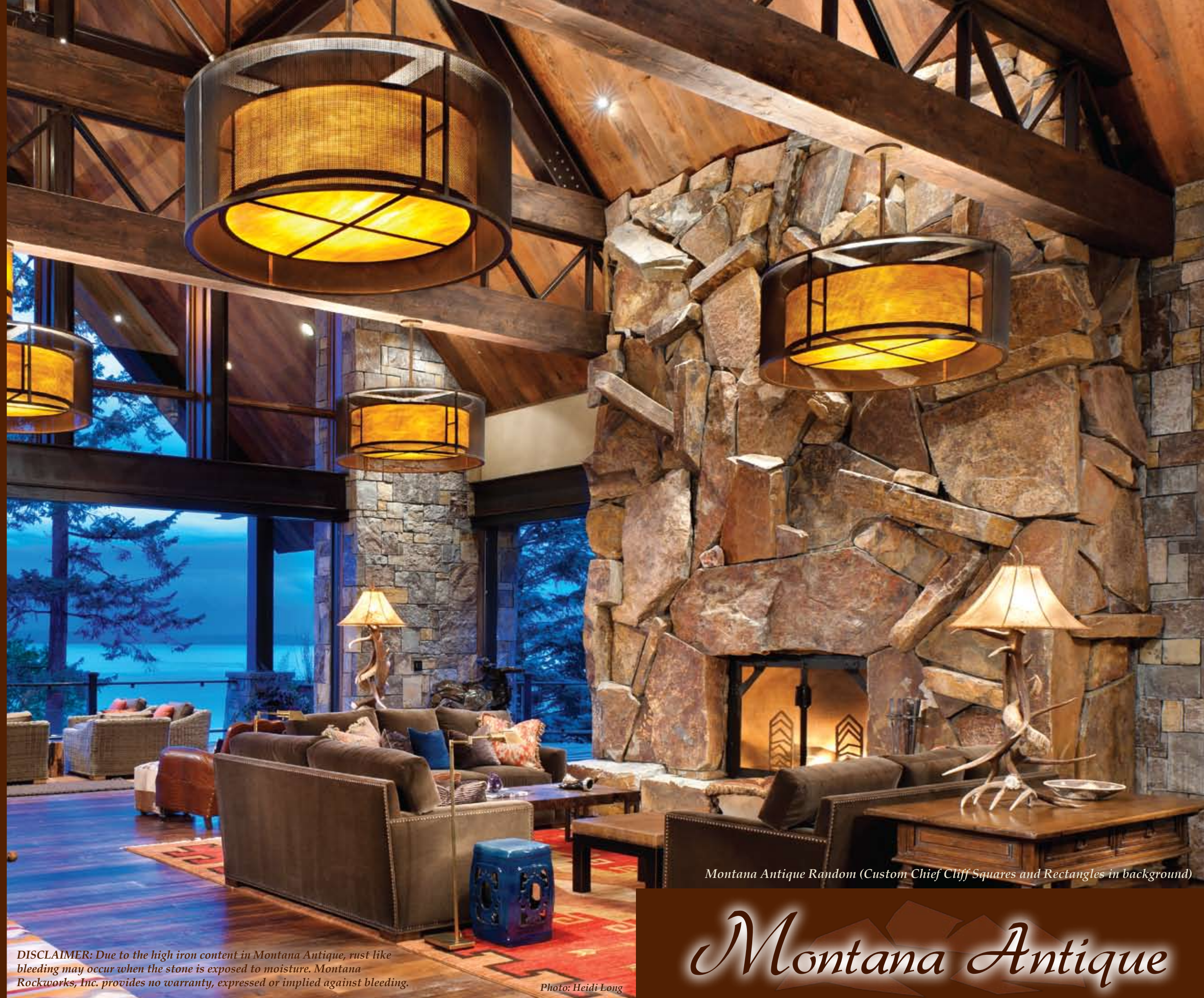
Montana Antique Random (Custom Chief Cliff Squares and Rectangles in background)

DISCLAIMER: Due to the high iron content in Montana Antique, rust like bleeding may occur when the stone is exposed to moisture. Montana Rockworks, Inc. provides no warranty, expressed or implied against bleeding.