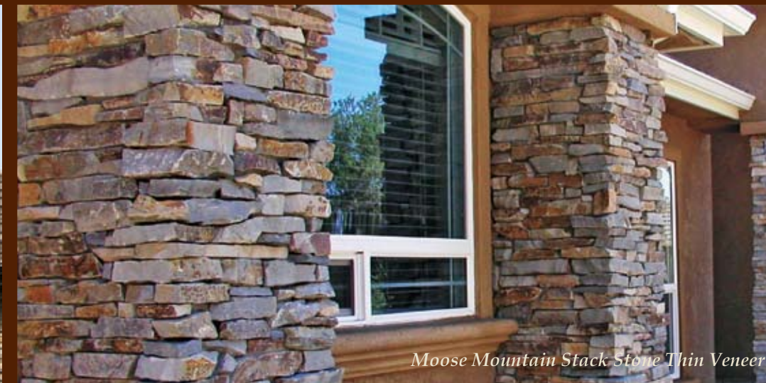
Moose Mountain Stack Stone Thin Veneer

*DISCLAIMER: Due to the high iron content in Montana Antique, rust like bleeding may occur when the stone is exposed to moisture. Montana Rockworks, Inc. provides no warranty, expressed or implied against bleeding.