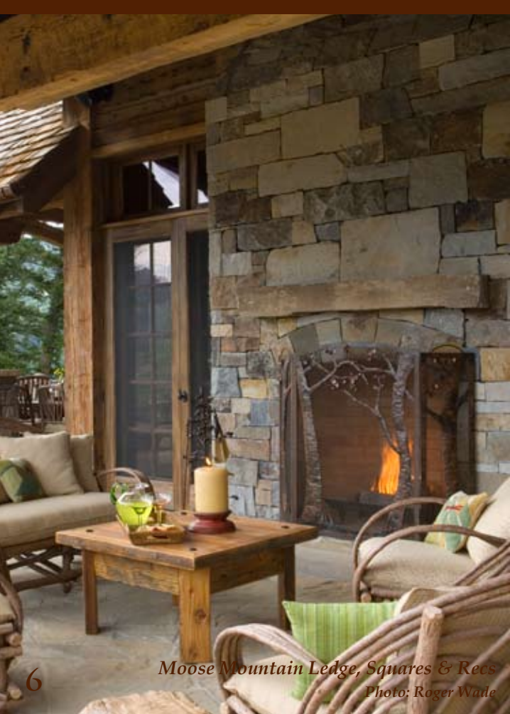
Moose Mountain Ledge, Squares & Recs