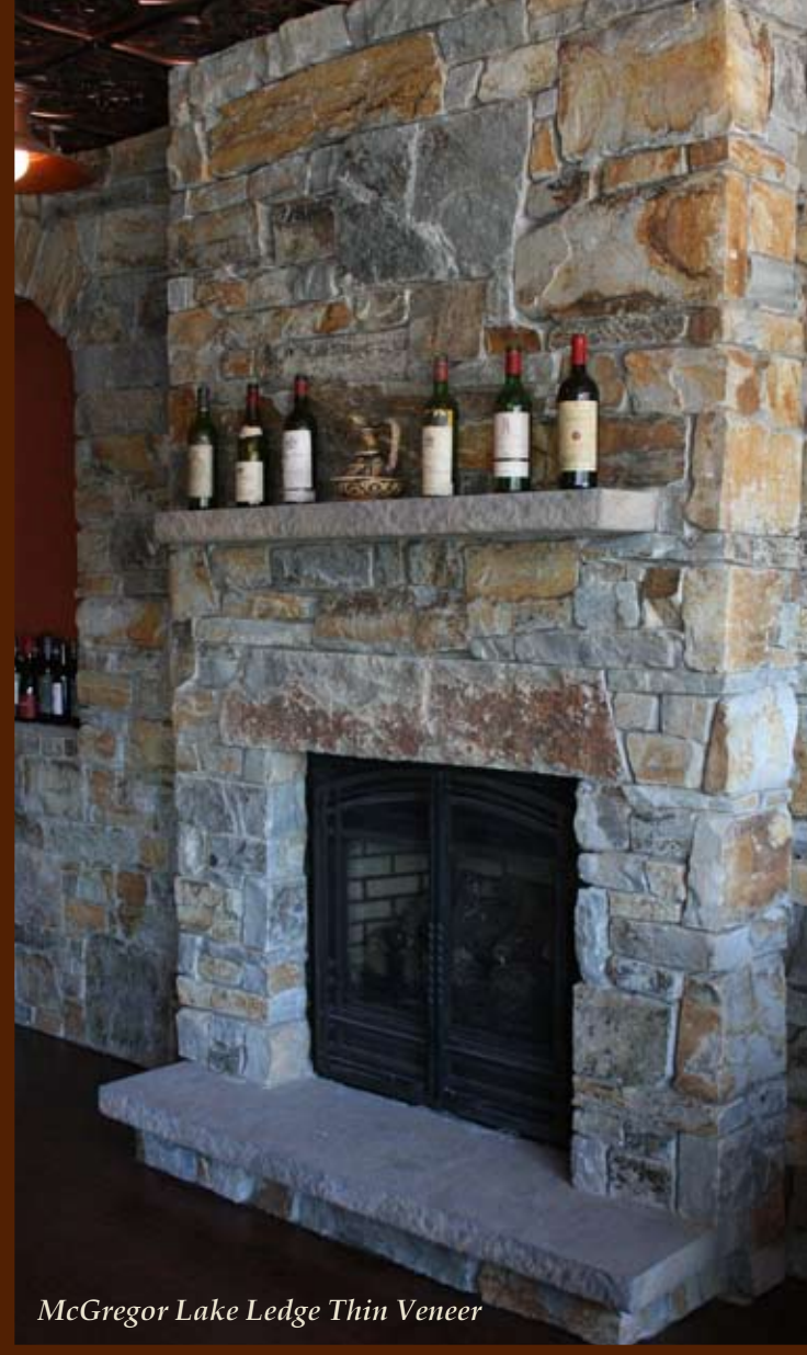
McGregor Lake Ledge Thin Veneer