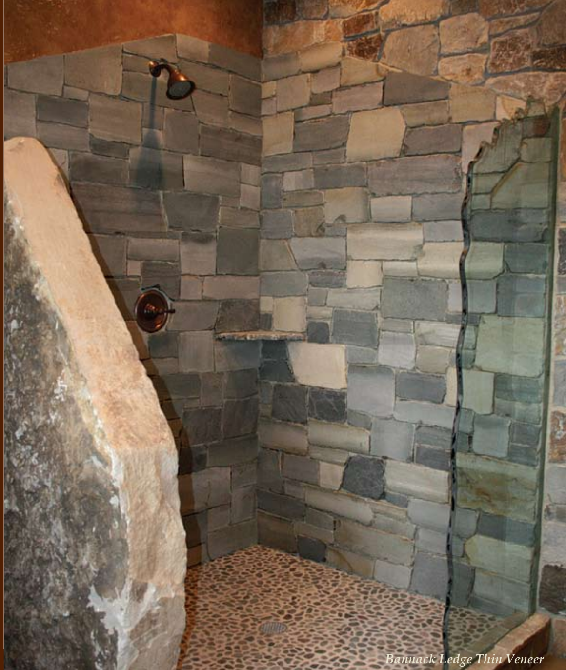
Bannack Ledge Thin Veneer