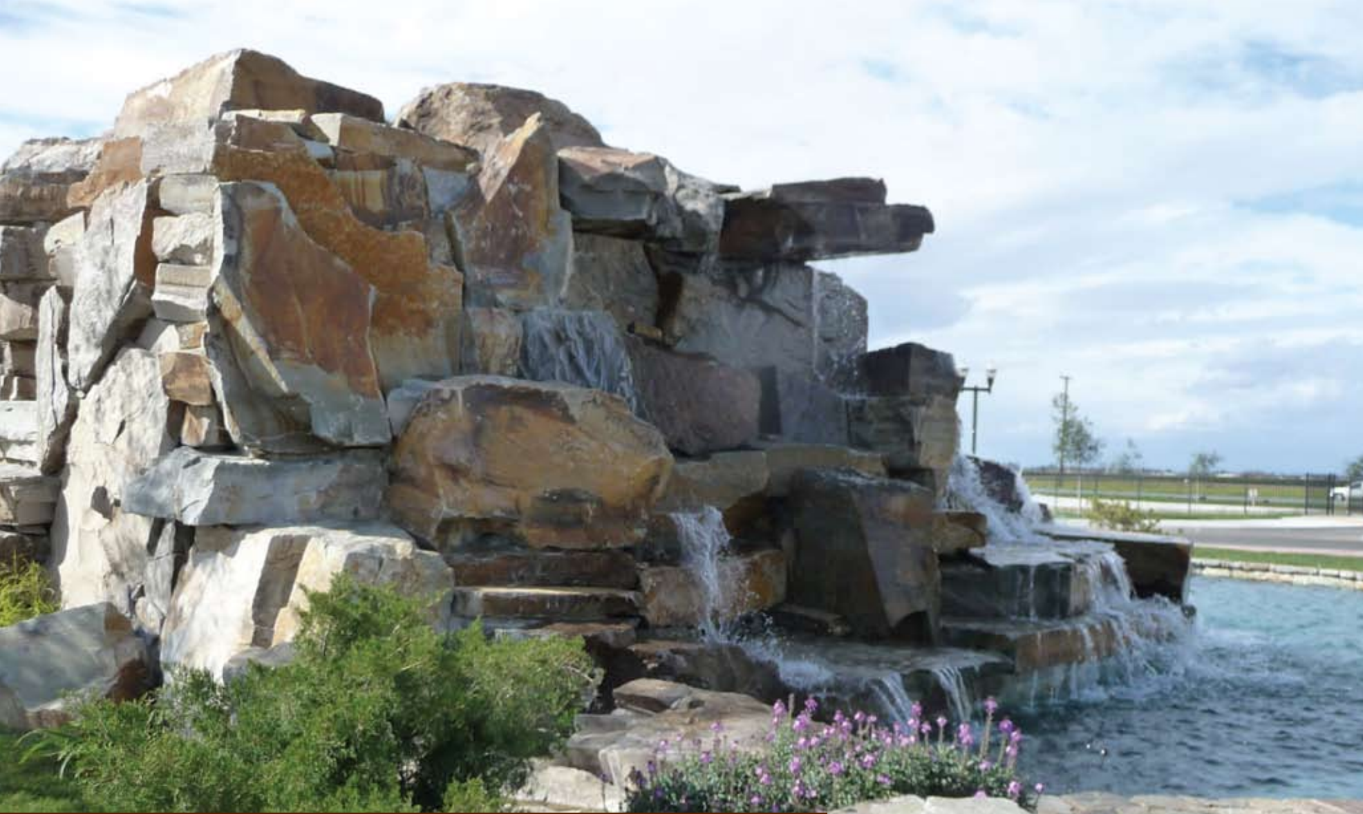
Ridge Creek Golf Course in Dinuba, CA McGregor Lake Oversized Drystack