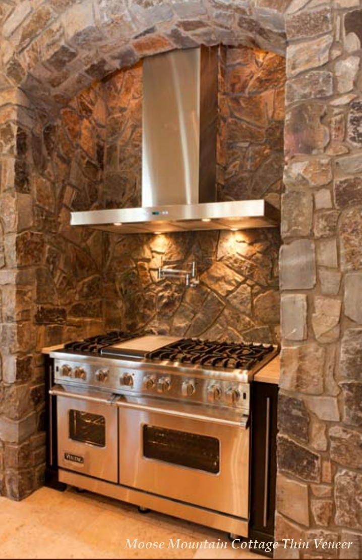
Moose Mountain Cottage Thin Veneer