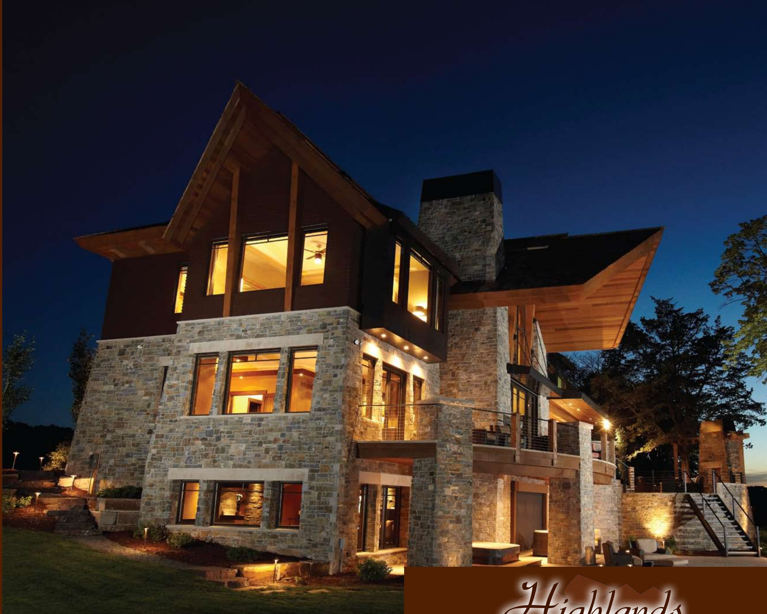
Highlands Ledge Thin Veneer