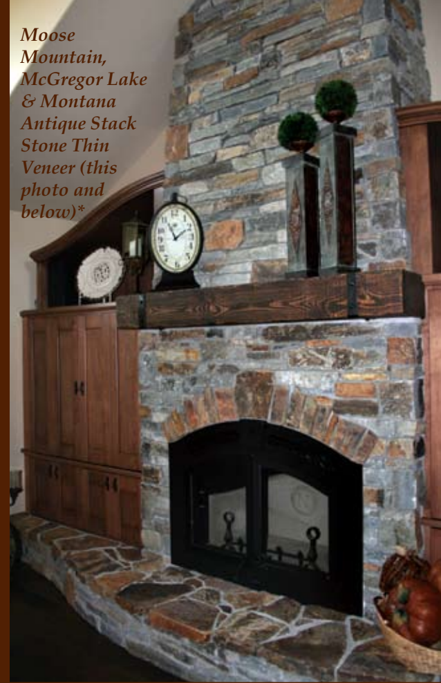
Moose Mountain, McGregor Lake & Montana Antique Stack Stone Thin Veneer (this photo and below)*