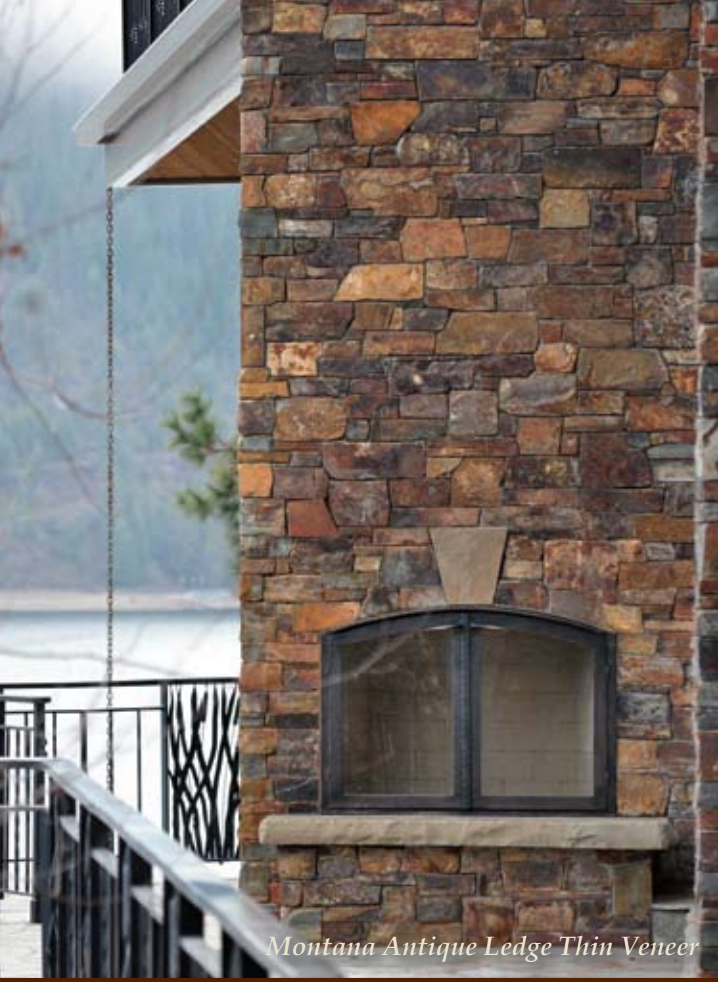
Montana Antique Ledge Thin Veneer