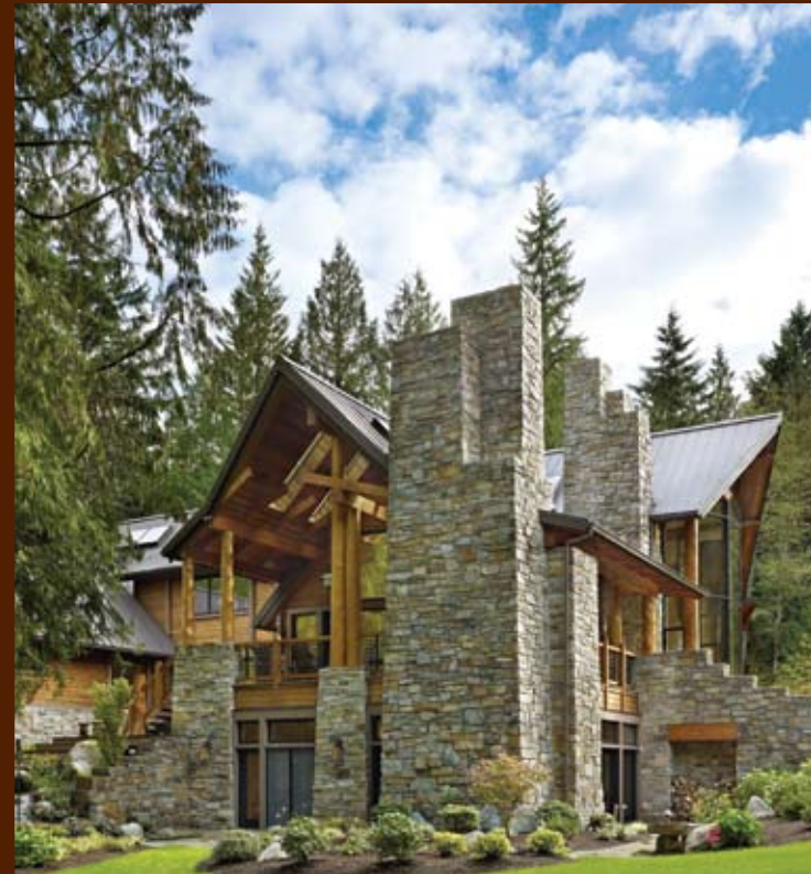
McGregor Lake Ledge & Oversized Ledge