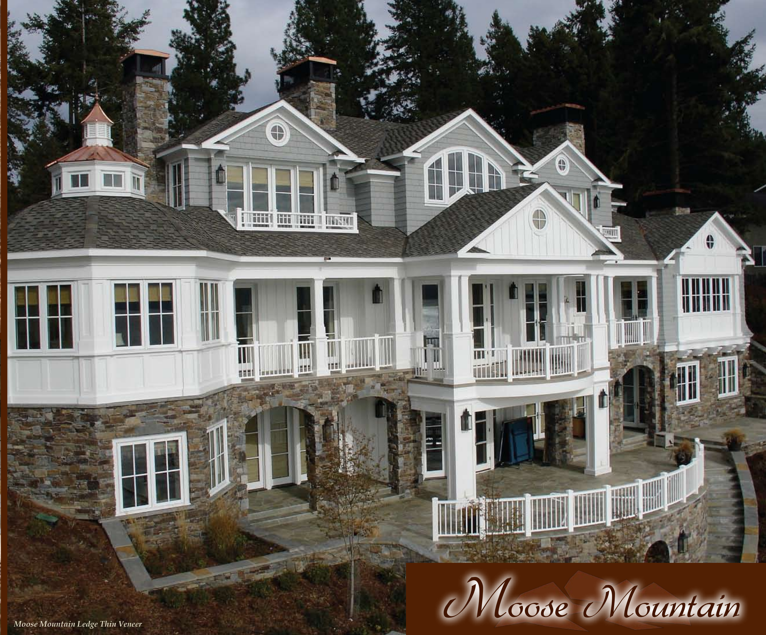
Moose Mountain Ledge Thin Veneer