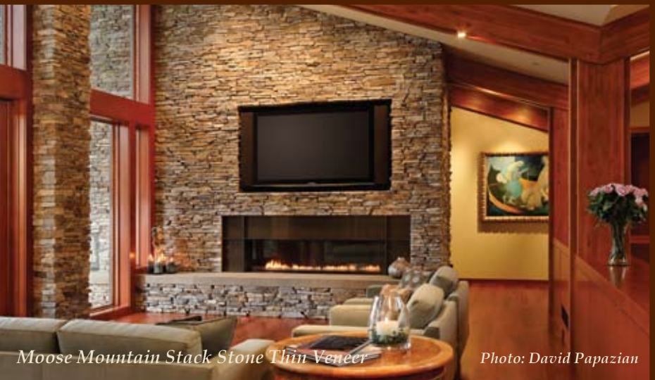
Moose Mountain Stack Stone Thin Veneer