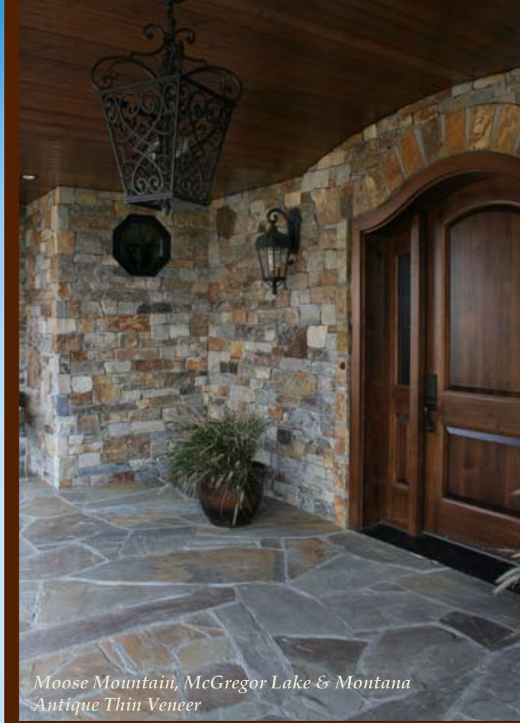
Moose Mountain, McGregor Lake & Montana Antique Thin Veneer