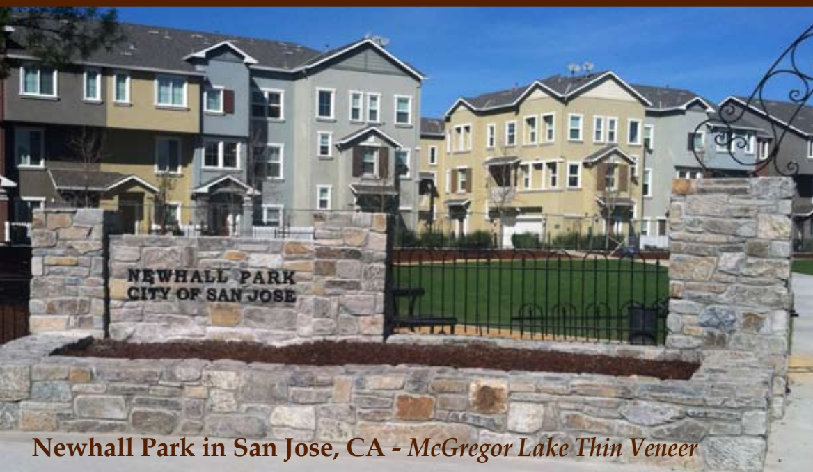
Newhall Park in San Jose, CA - McGregor Lake Thin Veneer