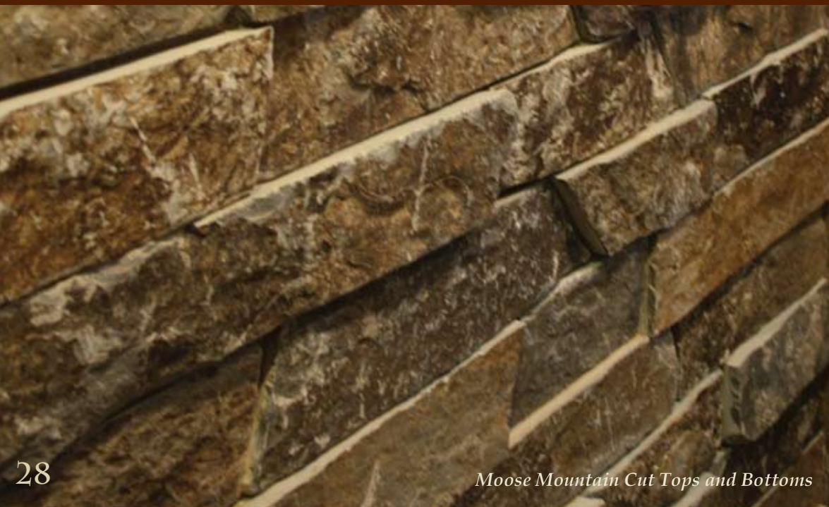
Moose Mountain Cut Tops and Bottoms