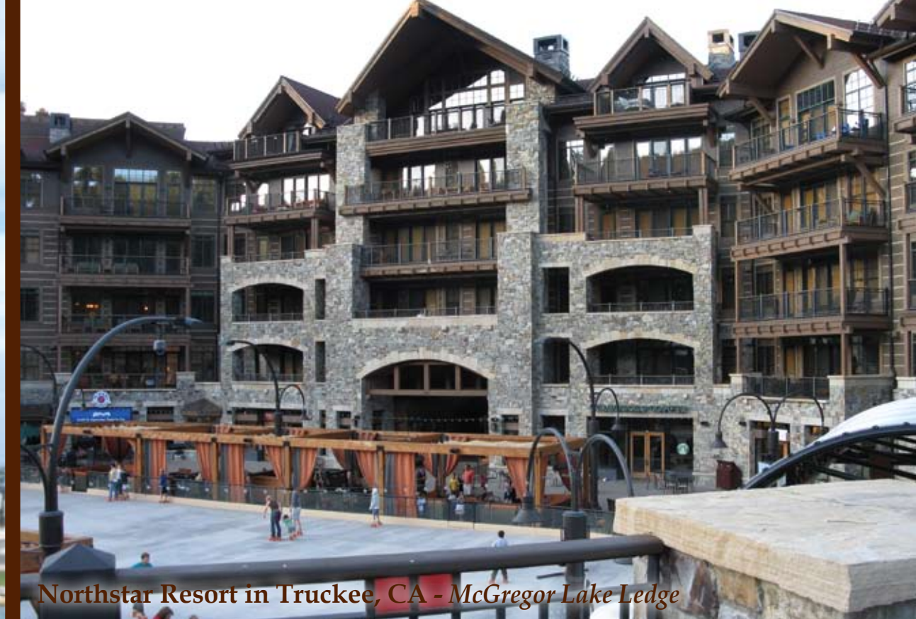
Northstar Resort in Truckee, CA - McGregor Lake Ledge