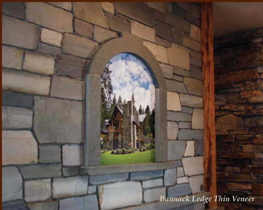
Bannack Ledge Thin Veneer