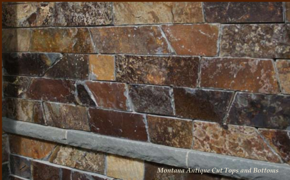
Montana Antique Cut Tops and Bottoms