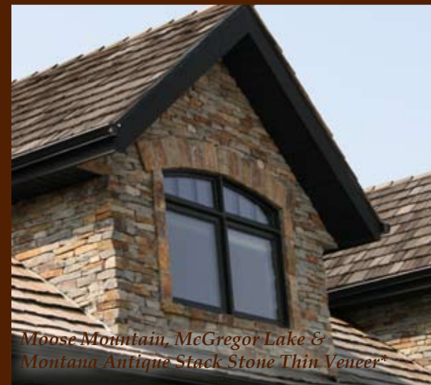
Moose Mountain, McGregor Lake & Montana Antique Stack Stone Thin Veneer*