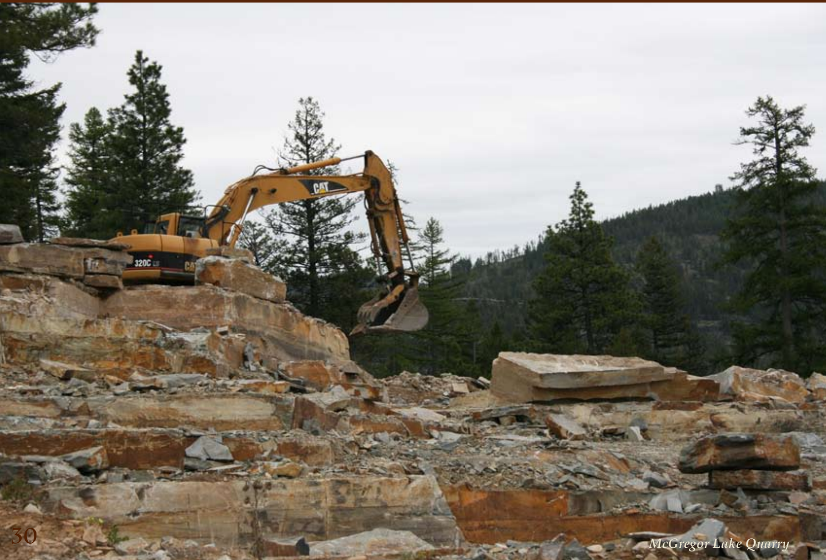
McGregor Lake Quarry

Thank you for choosing Montana Rockworks, Inc.